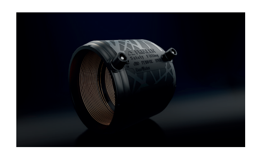
FRIALEN NXT UB Electrofusion coupler