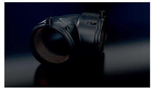
FRIALEN NXT W90 Electrofusion 90° elbow