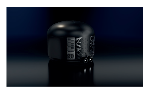
FRIALEN NXT MV Electrofusion end cap