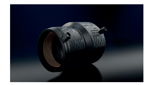
FRIALEN NXT MR Electrofusion reducing coupler