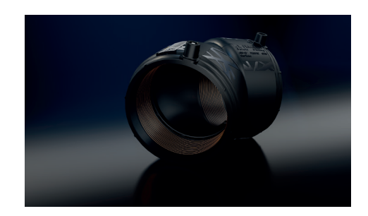
FRIALEN NXT W45 Electrofusion 45° elbow