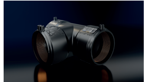
FRIALEN NXT T/TA Electrofusion tee